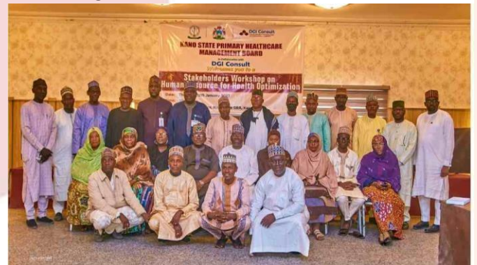
Figure 2: Stakeholders Validation Workshop on Human Resources for Health Interventions - Kano

(g) rapid facility assessment to have an objective insight into the current level of HRH optimization in the states; and (h) validation workshops to verify the data collected and seek stakeholders' input in the findings.