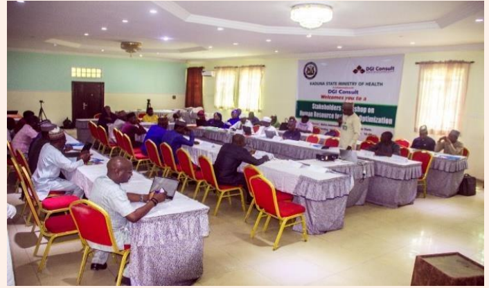
Figure 1: Stakeholders Workshop on Human Resources for Health Optimization- Kaduna State

The HRH situation analysis used mixed (quantitative and qualitative) methods to generate evidence on the gaps in HRH governance, financing, and political economy; HRH management and regulation; HRH optimization; and service delivery. The major activities conducted include (a) entry meetings to introduce the project to key stakeholders; (b) development of an HRH optimization framework to examine the HRH landscape; (c) development of data collection tools in line with the components of the theoretical framework; (d) literature review; (e) key informant interviews; (f) stakeholder workshops to obtain additional information;